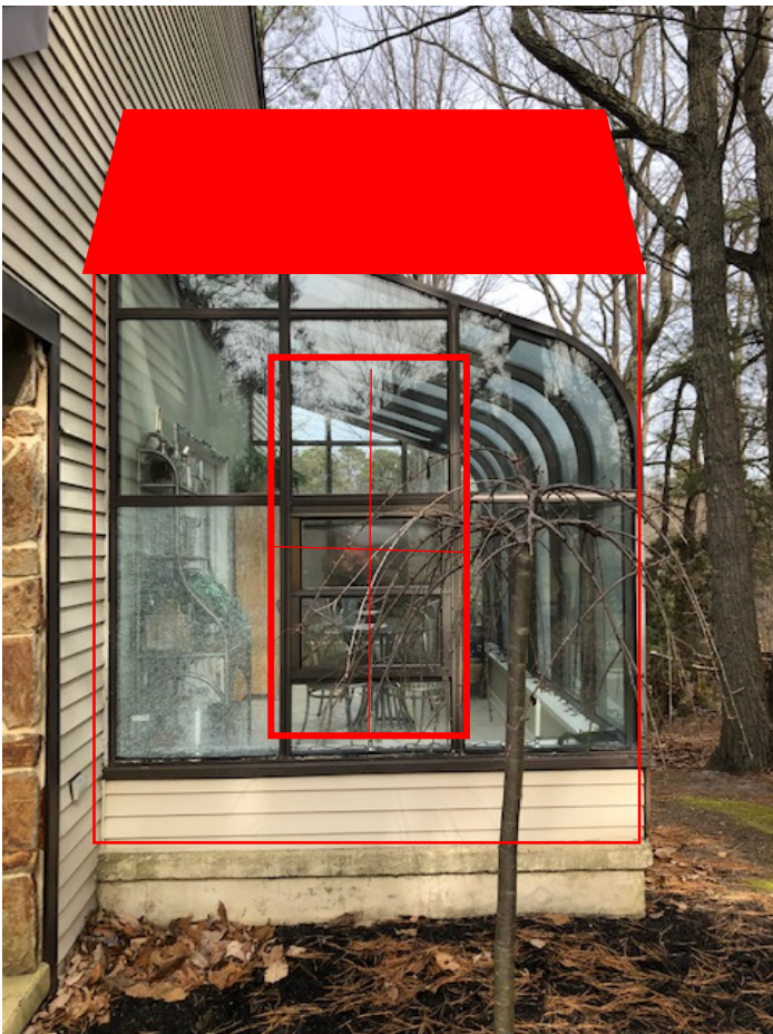
Figure 2 front yard