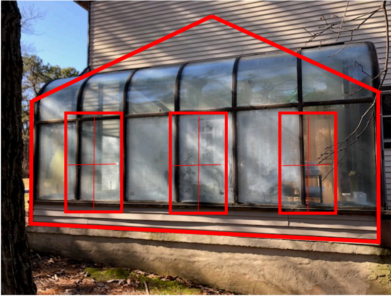
Figure 3 side yard